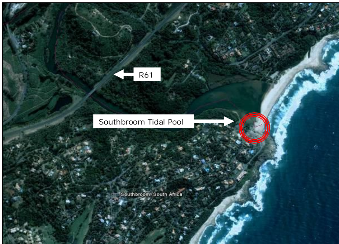
Figure 1: Location of Proposed Site

By completing and submitting the accompanying response form, you automatically register yourself as an I&AP for this project, and ensure that your comments, concerns or queries raised regarding the project will be noted.